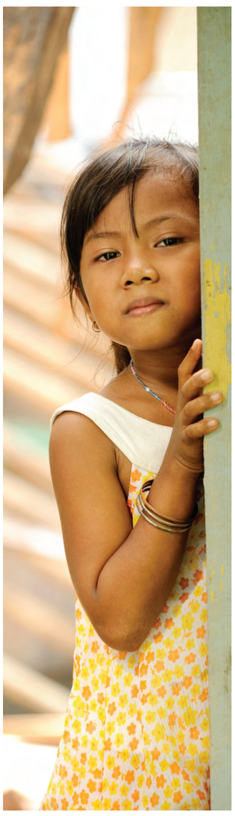
Until opportunities are available for all women and girls, the international fight for true equality must continue.

Let us stay united and keep fighting for true equality NOW.