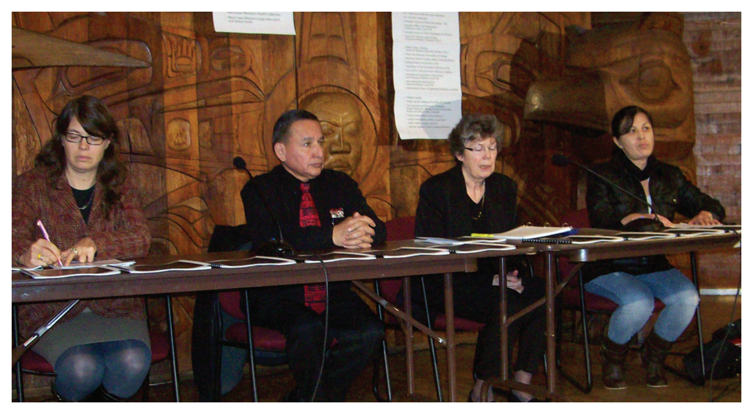
The B.C. government remains in violation of the United Nations' Convention on the Elimination of Discrimination against Women, and Canada has failed to file within one year a response on recommendations to correct the violations, says the B.C. Committee on