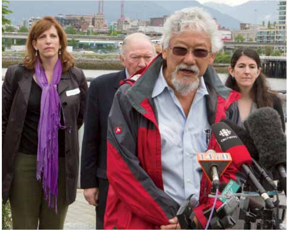
Dr. David Suzuki, and former Conservative Fisheries Minister John Fraser (partially visible behind Suzuki) are among the thousands of Canadians who have spoken out against the Harper government’s attack on nature and democracy.