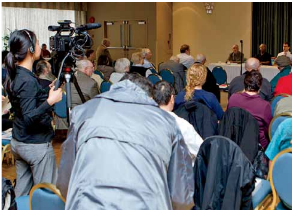
Working TV covered the major speeches delivered at the BC FORUM AGM. This was made possible by a generous contribution from the BCGEU. You can watch the speeches by following the links at www.bcforum.ca .