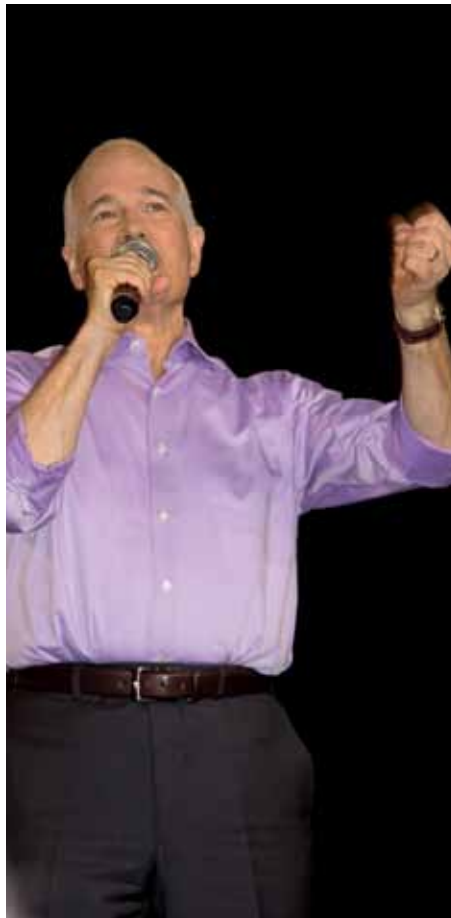
Jack Layton at a Vancouver election rally during the 2011 campaign.

It was 8 am. He read three pages of background on B.C. housing issues while having breakfast at a downtown Vancouver hotel. Despite