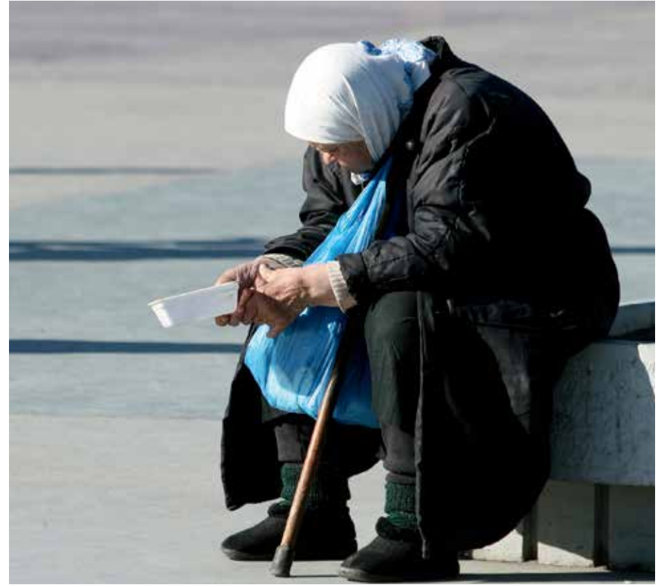
The number of seniors who are homeless has increased by 75 percent since 2008 according to this year's homeless count in Metro Vancouver.

tute says expansion of the TFW program has driven up B.C. unemployment levels by 4.8 percentage points.