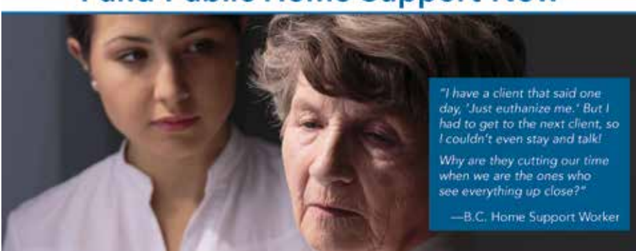
Tell the government to fully fund home support. Sign the petition at: