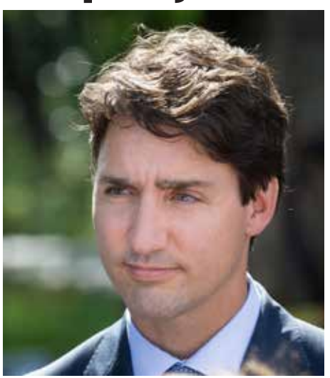
Prime Minister Justin Trudeau

"Canada needs investment in a green industrial transformation, not more of the same private-public partnerships that short-change workers and communities," said Yussuff.