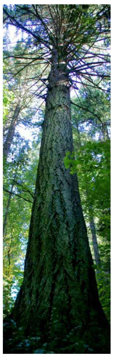
Raw log exports from publicly-owned old growth forests have soared while BC jobs disappear.