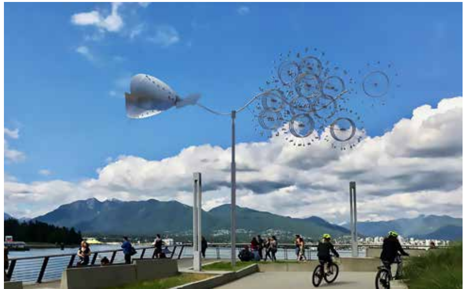
A photo illustration of "Magic and Lethal: The Asbestos Memorial." Commissioned by the B.C. Labour Heritage Centre, the artwork will be installed on the Vancouver waterfront later this spring.

Installation of the artwork will take place in Spring 2021.