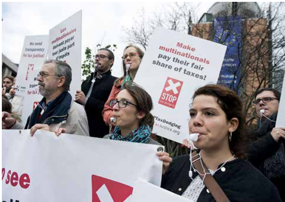
Blowing the whistle on tax cheats: activists in Brussels (above) and around the world gathered in pre-pandemic protests to call for tax justice.

The report does not estimate the indirect costs which arise when governments reduce corporate tax rates to try to attract multinational corporations. This tax competition or race to the bottom “is a false economy which a wide body of evidence has shown leads to even lower tax revenue for all governments,” says the report.