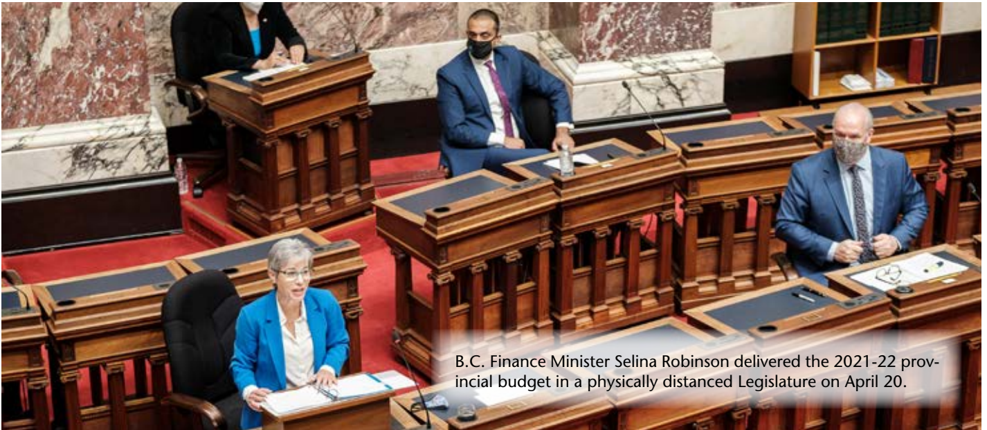
B.C. Finance Minister Selina Robinson delivered the 2021-22 provincial budget in a physically distanced Legislature on April 20.