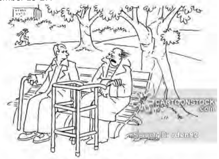
The only thing I don't like about retirement, is you never get a day off ! *