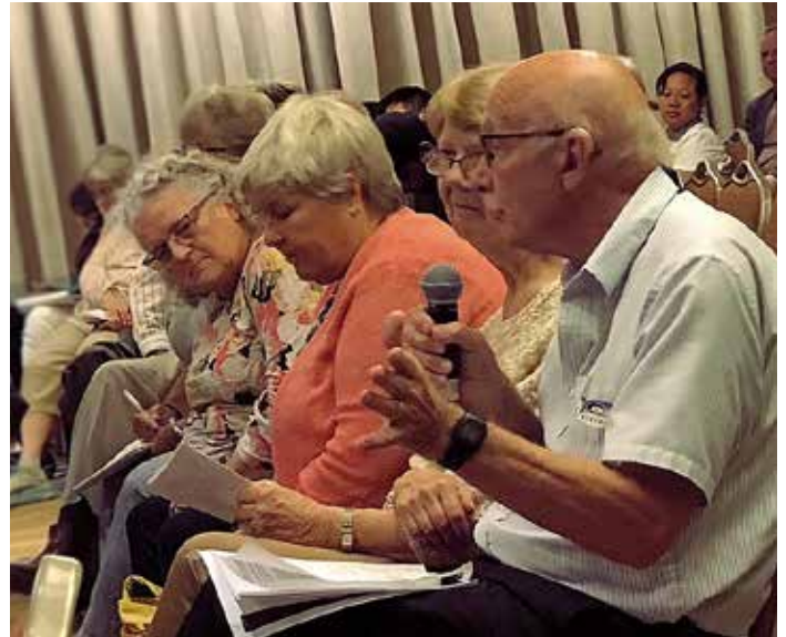
Community consultation on pharmacare

T HE BC Health Coalition says "medicine is health care." However, one study reported that 29 percent of British Columbians – the highest level in Canada – said they or someone