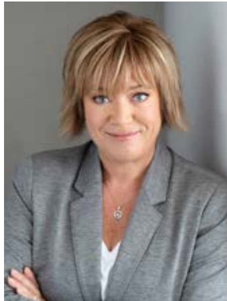
Terri McConnachie

Sidewalks and our civic buildings need to allow for safe movement for seniors, with indoor and outdoor recreational opportunities accessible all twelve months of the year. We need a variety of housing options for seniors at all income levels. The cost for market and rental housing