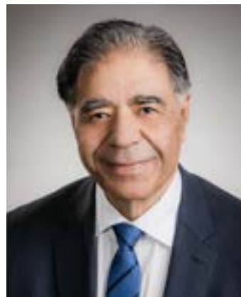
Sal Dhaliwal

Just recently, the City of Burnaby invested $30 million to save and secure 425 co-op housing units where the long-term residents – mostly older adults – were at risk of losing their homes to private developers.