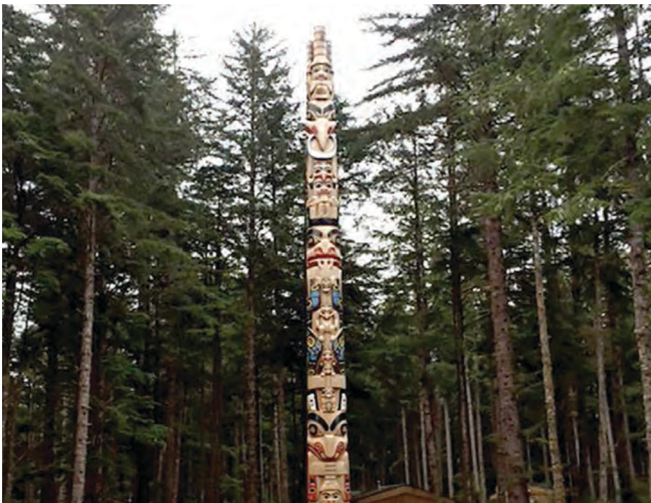
Hiellen Longhouse Village, Masset, Haida Gwaii

This June, take the time to explore Indigenous events in your community. Attend a Powwow, peruse an Indigenous artisan market or read a book by an Indigenous author. Challenge yourself by enrolling in the free online Indigenous Canada Course at the University of Alberta taught by First Nations people. Take the time to talk to an Elder. Familiarize yourself with the 94 calls to action from the Truth and Reconciliation Committee. Be an ally. Celebrate National Indigenous History Month and National Indigenous Peoples Day (June 21); you will be richly rewarded.